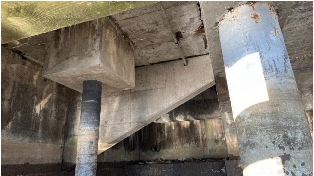
Tags:Pile Caps, Report Photos | Taken by:Matthew Seinuk | Date taken:03/11/2025 Media 2: Bent 1, P-1, Deck under between bent one and two.