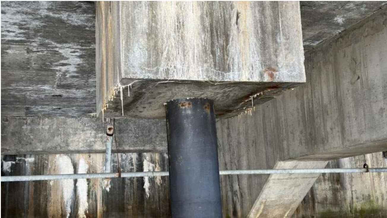
Tags:Pile Caps Date taken:03/12/2025 Media 158: Bent 35, P-35, Underside between bents 35 and 36.