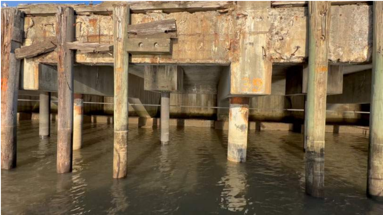
Tags: Pile Caps Date taken: 03/24/2025 Media 172: Bent 39, P-39