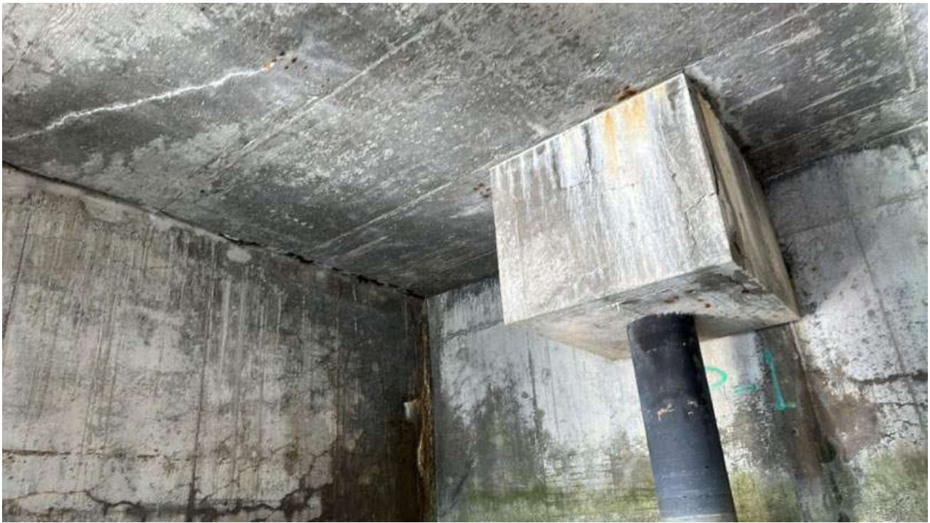
Tags:Pile Caps Date taken:03/11/2025 Media 213: Bent 47, P-46, Underside between Bents 46 and 47.