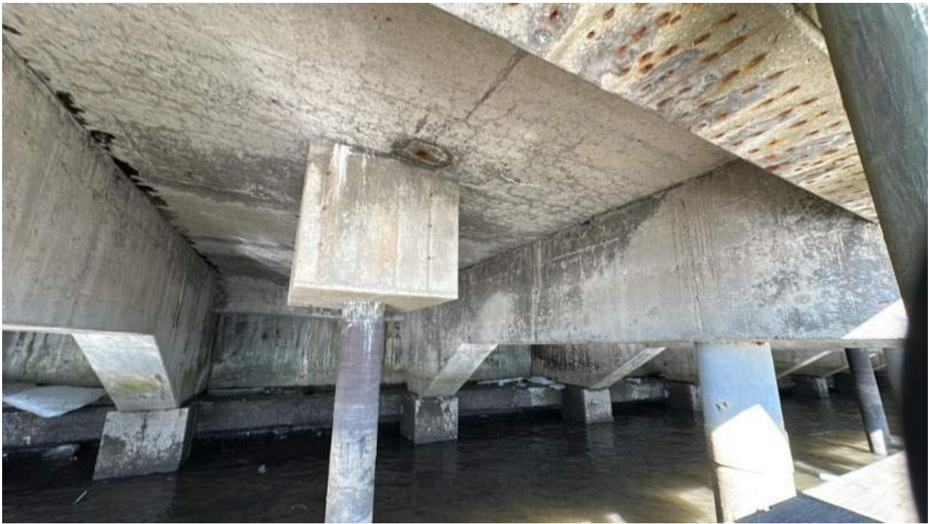
Tags:Pile Caps Date taken:03/11/2025 Media 25: Bent 5, P-5, Underside between bents 5 and 6.