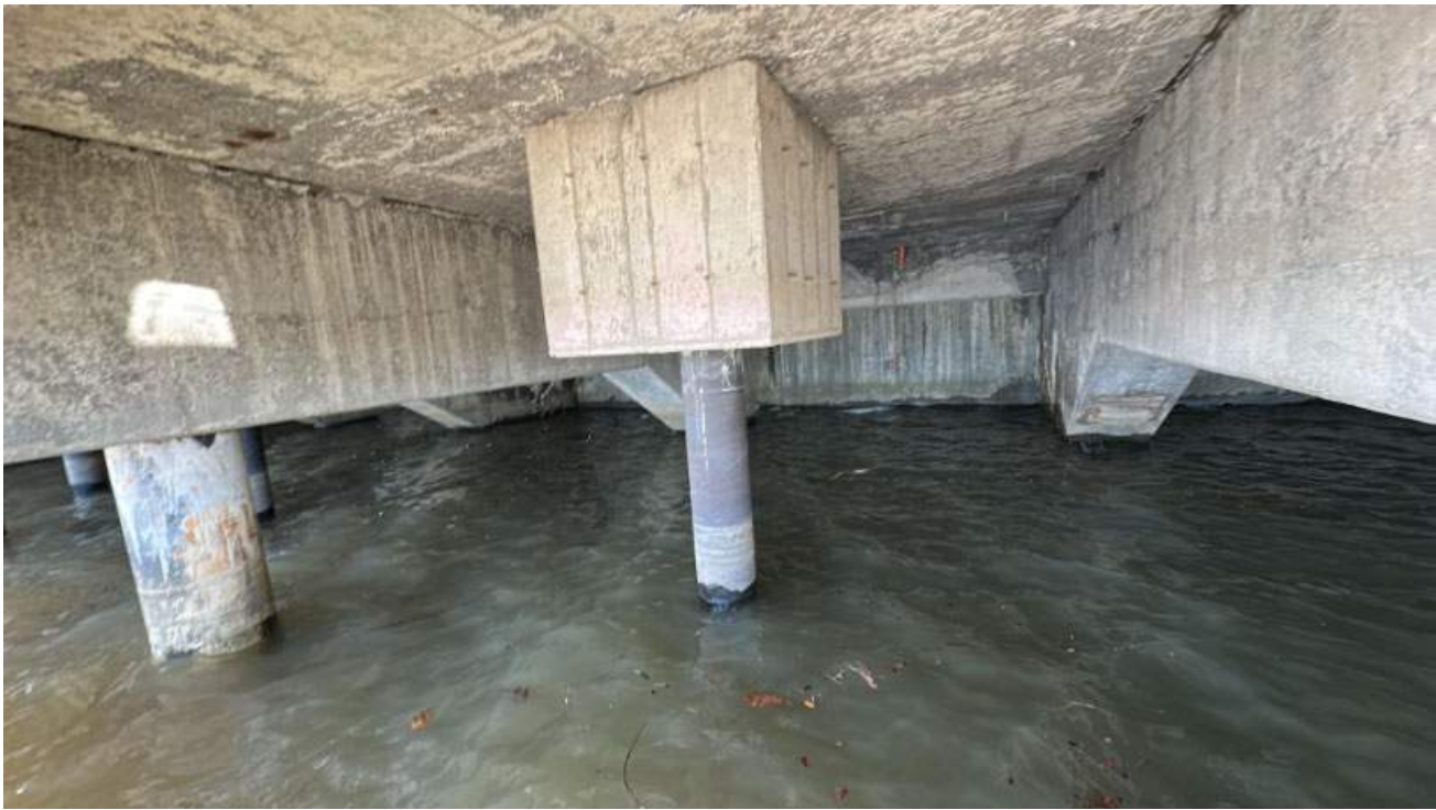
Tags: Pile Caps Date taken: 03/11/2025 Media 85: Bent 16, P-16, Underside between bents 16 and 17.