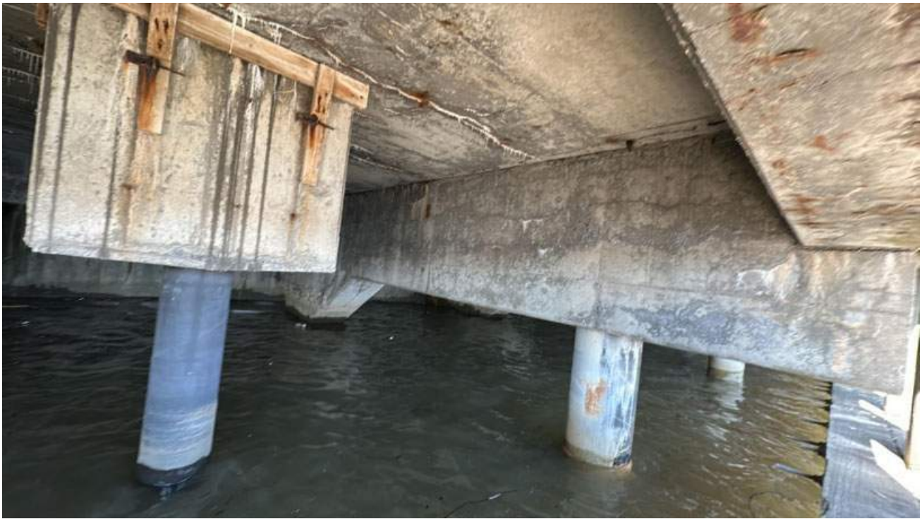
Tags: Pile Caps Date taken: 03/11/2025 Media 99: Bent 19, P-19, Underside of deck between bents 19 and 20.