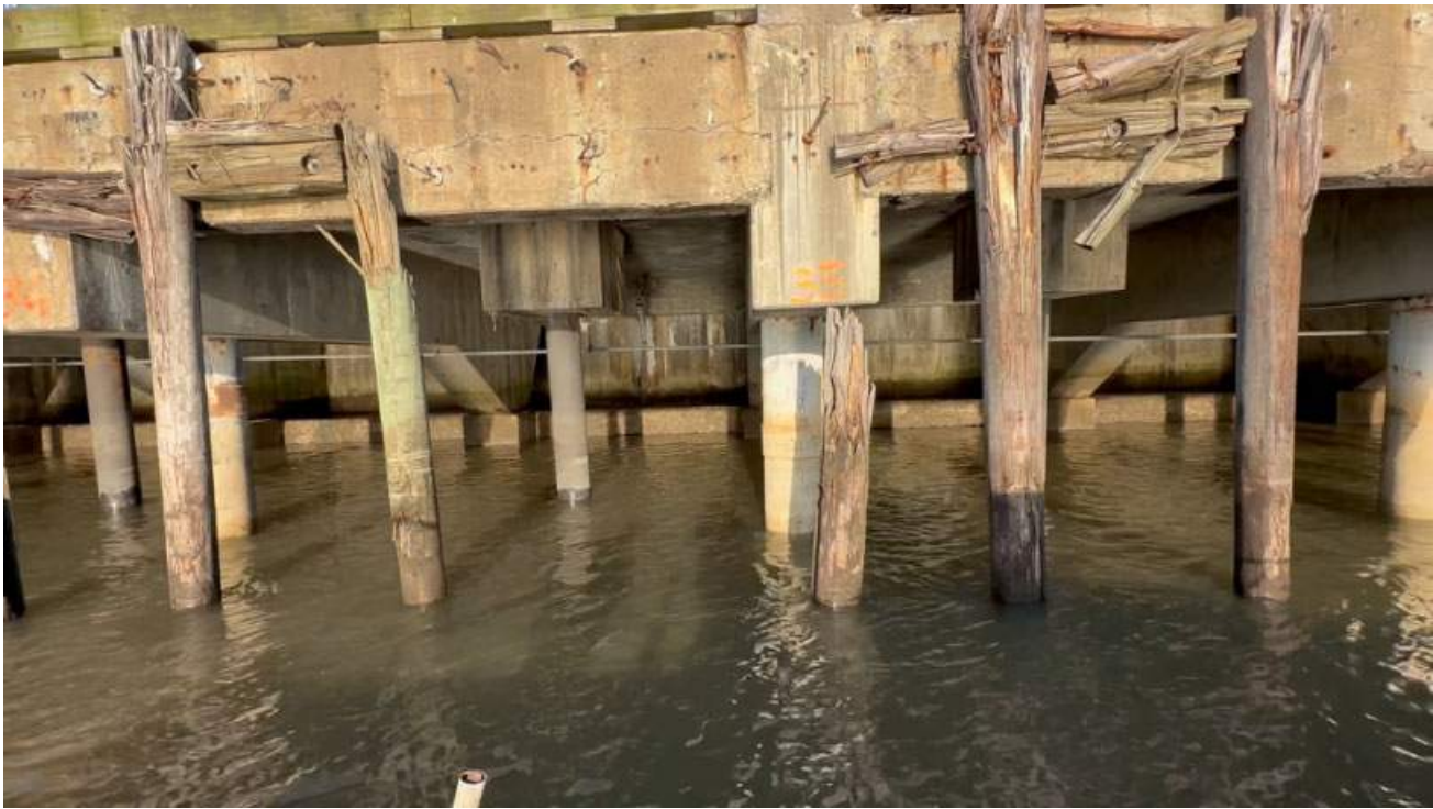
Tags:Pile Caps Date taken:03/24/2025 Media 157: Bent 35, P-35