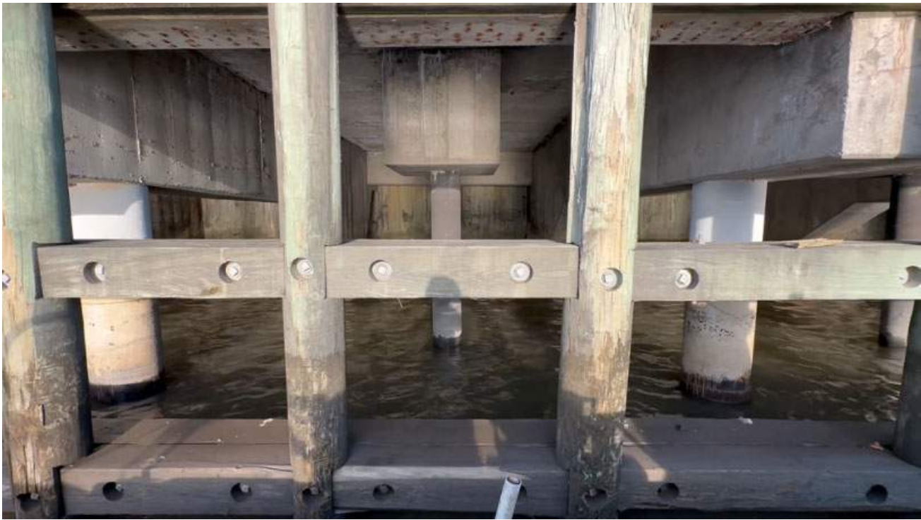
Tags: Pile Caps Date taken: 03/24/2025 Media 27: Bent 6, P-6