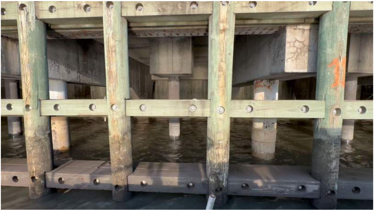
Tags:Pile Caps Date taken:03/24/2025 Media 53: Bent 10, P-10