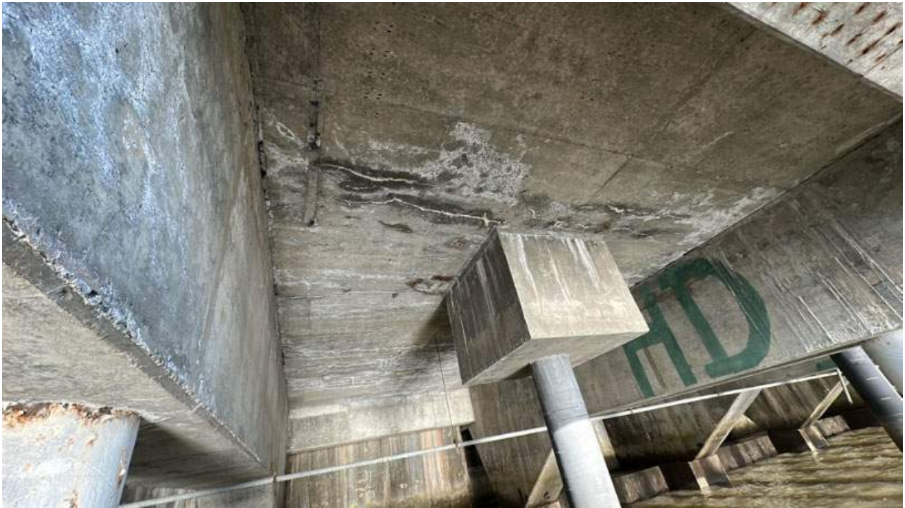
Tags:Pile Caps Date taken:03/12/2025 Media 136: Bent 30, P-30, Underside between Bents 30 and 31.