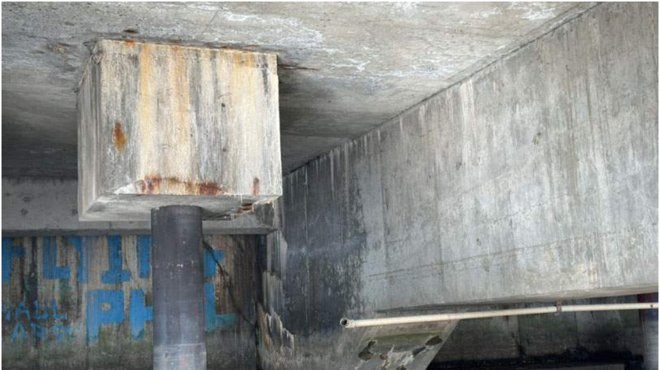
Tags:Pile Caps, Report Photos Taken by:Matthew Seinuk Date taken:03/12/2025 Media 196: Bent 43, P-43, Underside between bents 43 and 44.