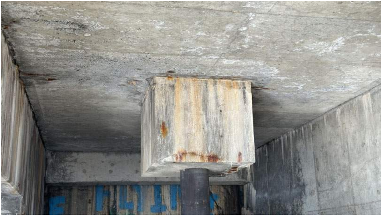
Tags:Pile Caps Date taken:03/12/2025 Media 195: Bent 43, P-43, Underside between bents 43 and 44.