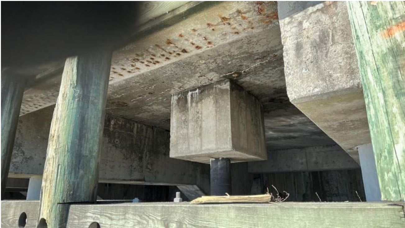
Tags: Pile Caps  Date taken: 03/11/2025 Media 28: Bent 6, P-6, Underside between bents 6 and 7.