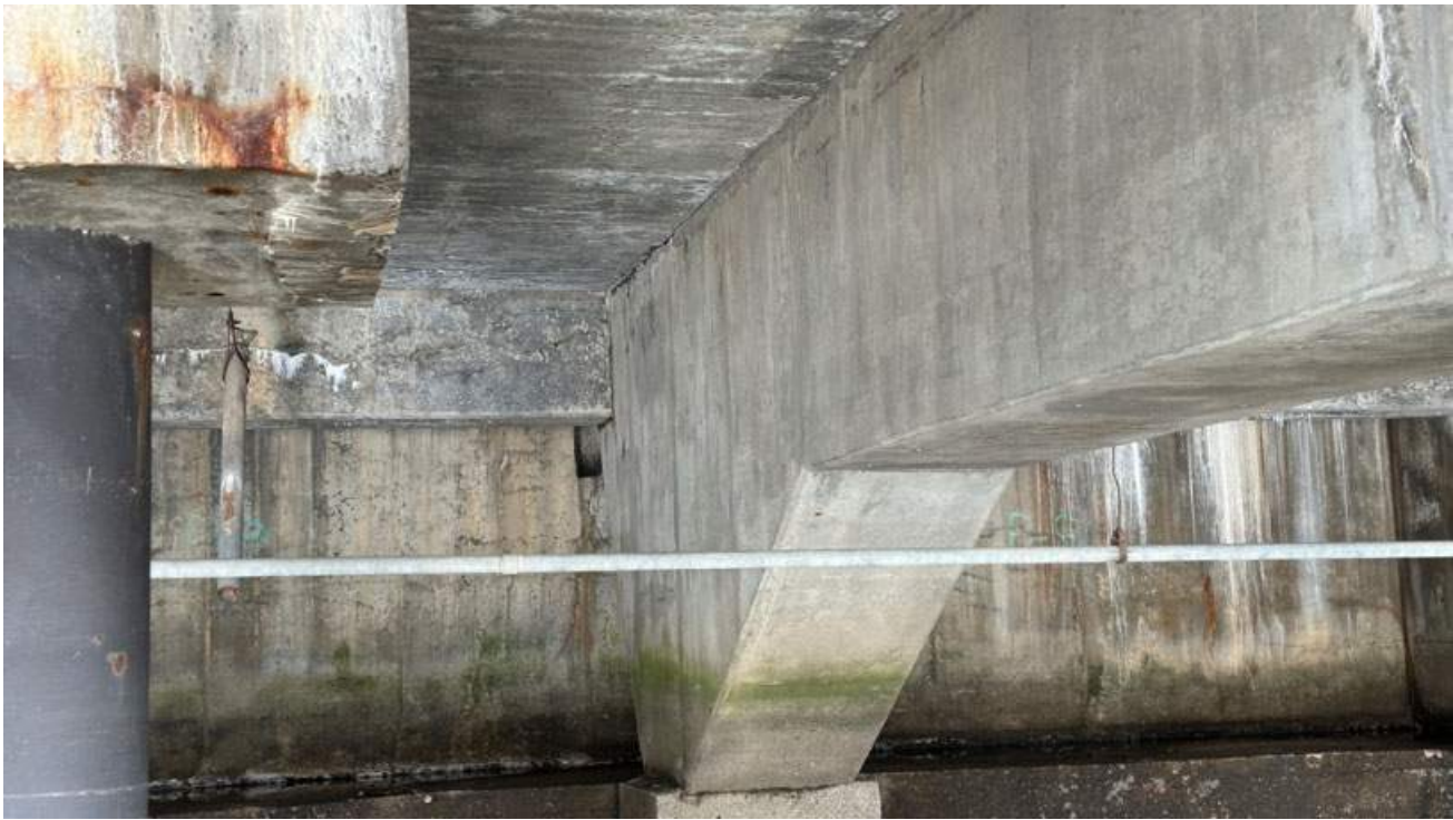
Tags: Pile Caps Date taken: 03/12/2025 Media 171: Bent 38, P-38, Underside between bents 38 and 39.