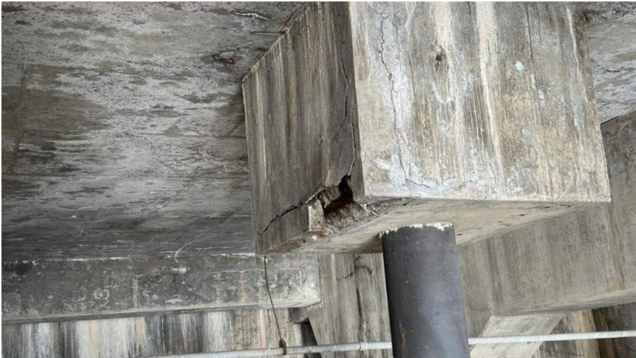
Tags:Pile Caps, Report Date taken:03/12/2025 Media 162: Bent 36, P-36, Underside between bents 36 and 37.