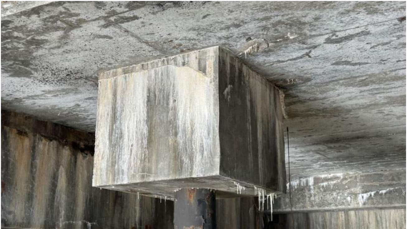
Tags: Pile Caps Date taken: 03/12/2025 Media 148: Bent 33, P-33, Underside between Bents 33 and 34.