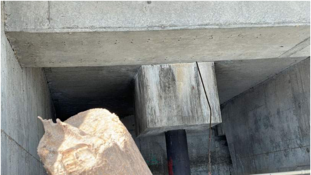
Tags: Pile Caps Date taken: 03/12/2025 Media 200: Bent 44, P-44, Underside between bents 44 and 45.