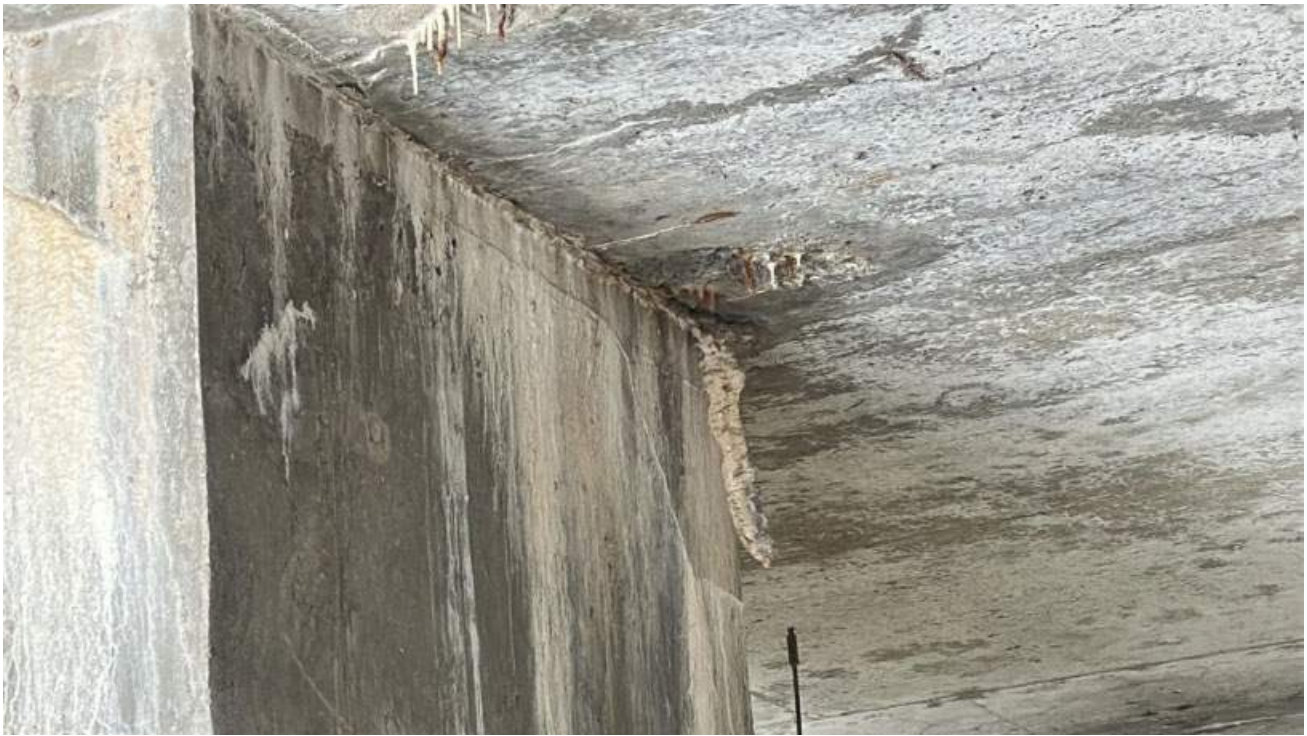
Tags: Pile Caps Date taken: 03/12/2025 Media 147: Bent 33, P-33, Underside between Bents 33 and 34.