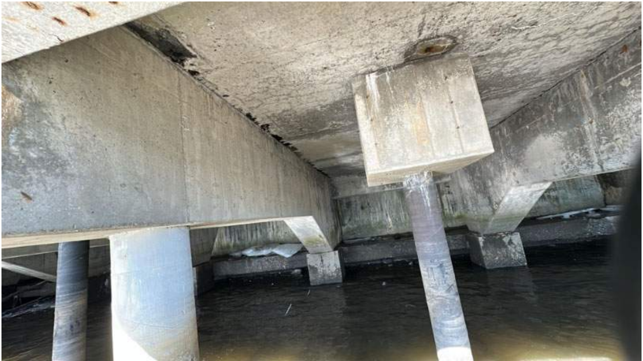
Tags:Pile Caps Date taken:03/11/2025 Media 26: Bent 5, P-5, Underside between bents 5 and 6.