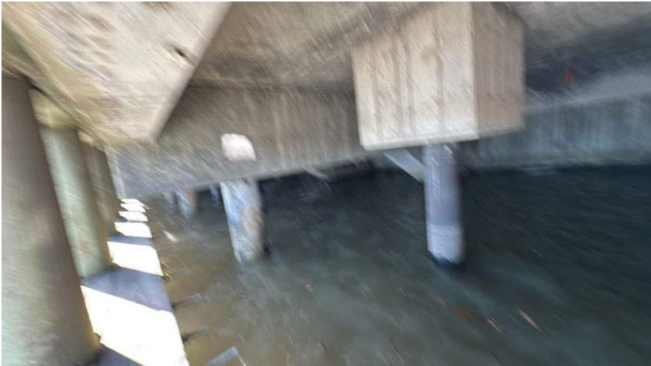
Tags: Pile Caps Date taken: 03/11/2025 Media 86: Bent 16, P-16, Underside between bents 16 and 17.