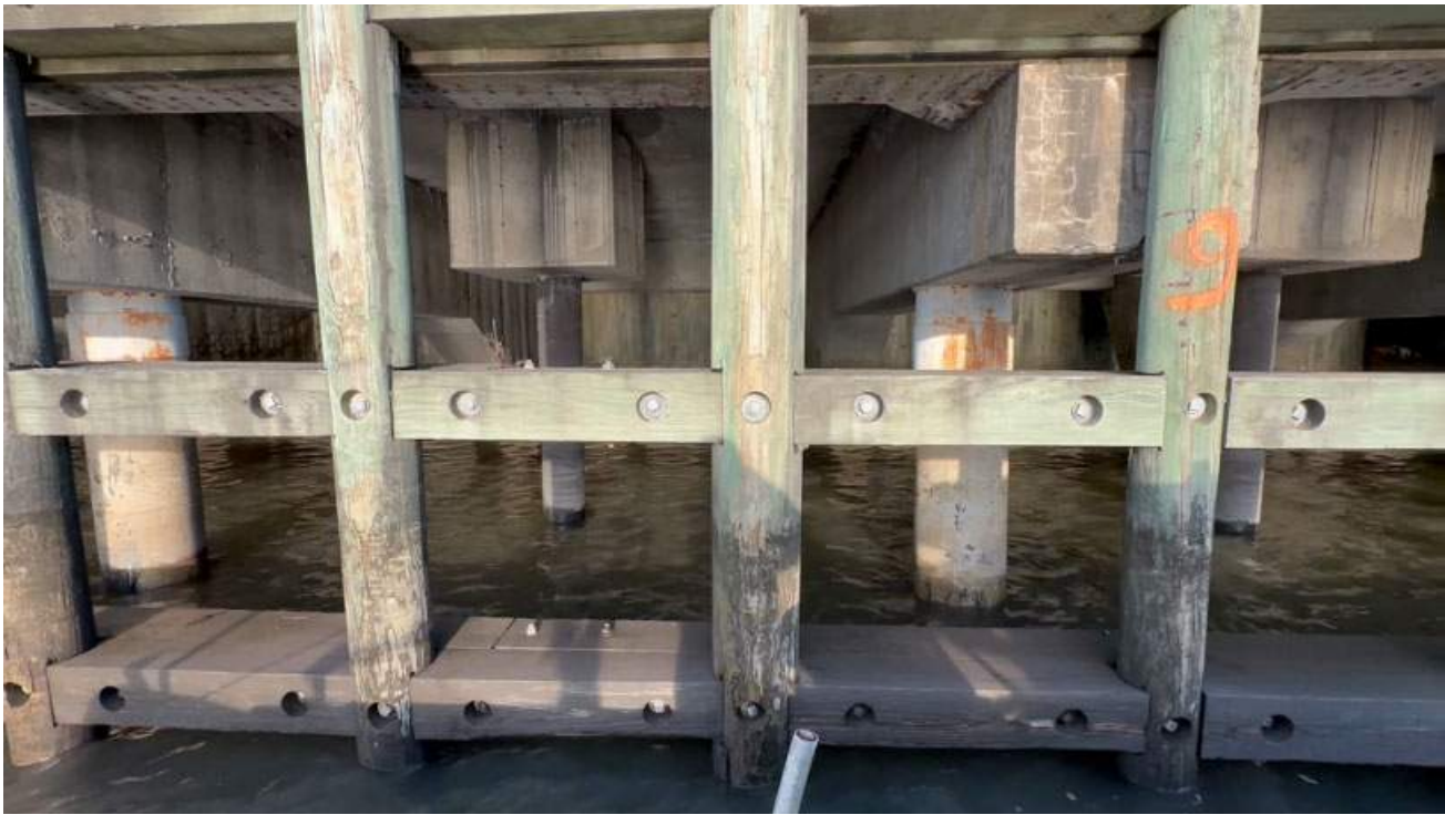
Tags: Pile Caps Date taken: 03/24/2025 Media 39: Bent 8, P-8