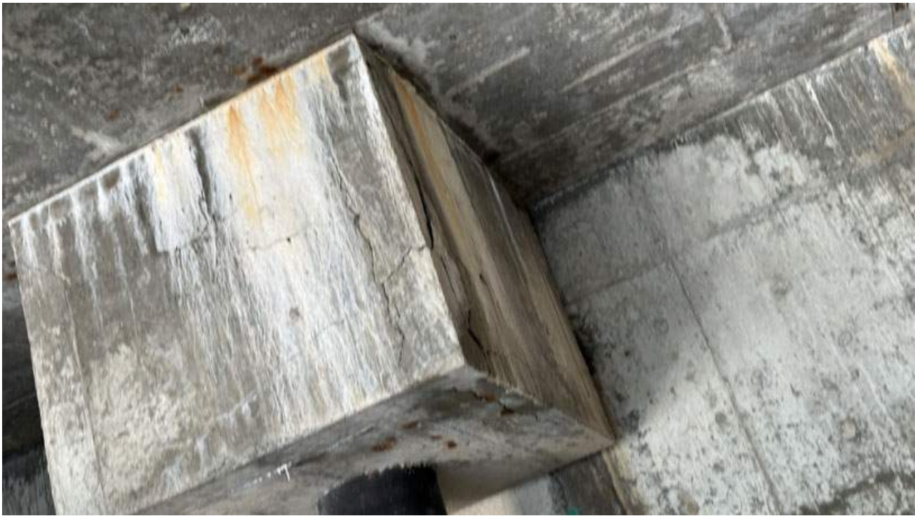
Tags:Pile Caps Date taken:03/11/2025 Media 209: Bent 46, P-46, Significant cracking on last rail pile cap.