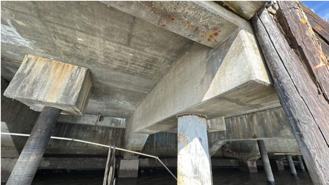
Tags:Pile Caps Date taken:03/12/2025 Media 186: Bent 41, P-41, Underside between bents 41 and 42.