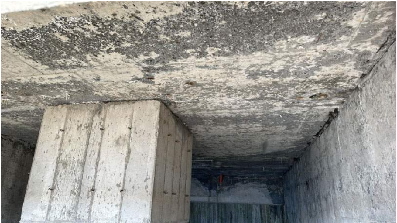
Tags:Pile Caps Date taken:03/11/2025 Media 82: Bent 16, P-16, Underside between bents 16 and 17.