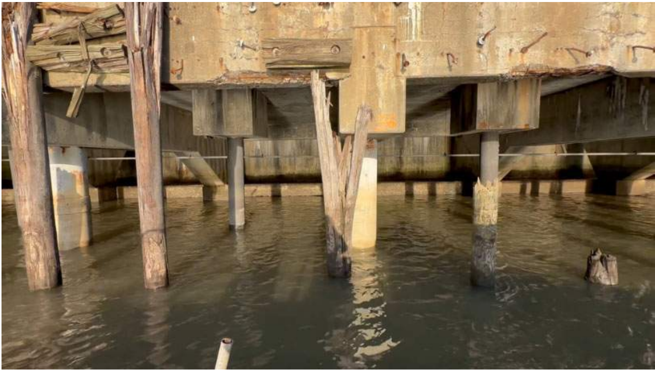
Tags:Pile Caps Date taken:03/24/2025 Media 161: Bent 36, P-36