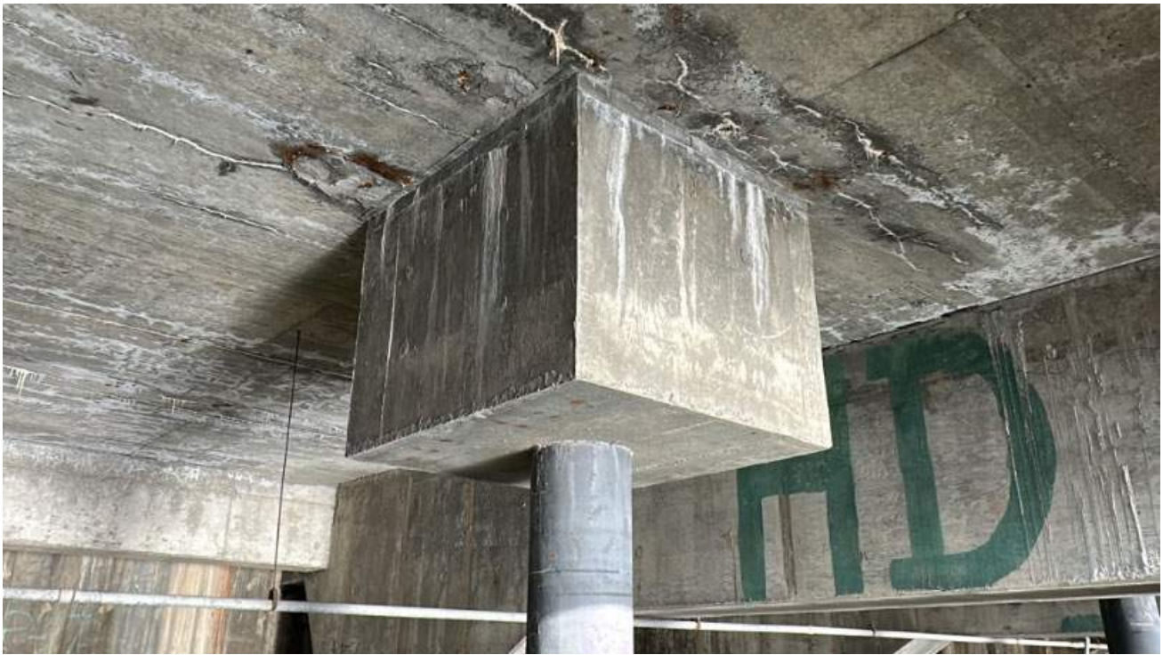
Tags:Pile Caps Date taken:03/12/2025 Media 135: Bent 30, P-30, Underside between Bents 30 and 31.