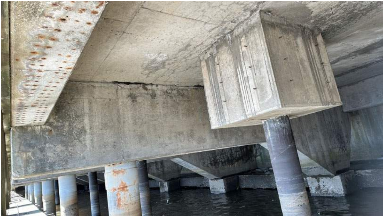
Tags: Pile Caps Date taken: 03/11/2025 Media 40: Bent 8, P-8, Underside between bents 8 and 9.