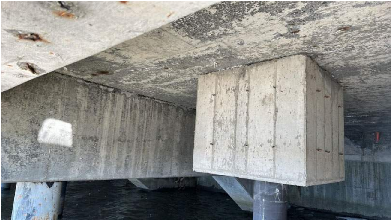
Tags:Pile Caps Date taken:03/11/2025 Media 81: Bent 16, P-16, Underside between bents 16 and 17.