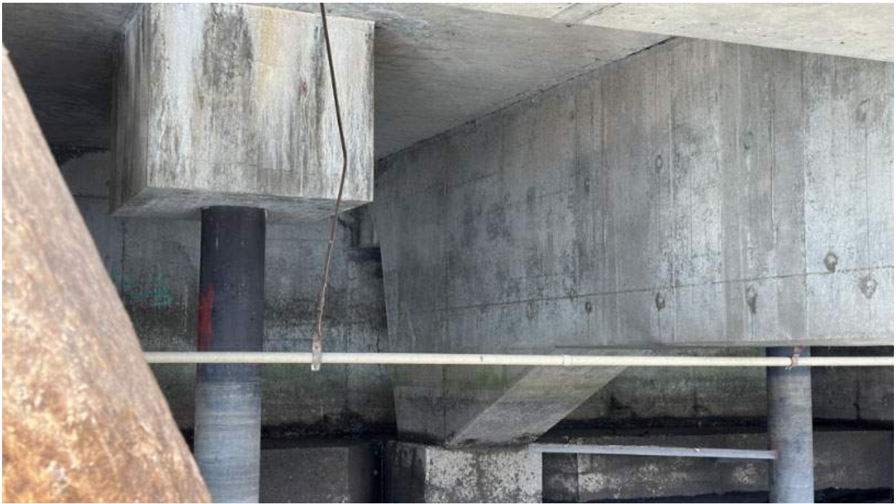
Tags: Pile Caps Date taken: 03/12/2025 Media 199: Bent 44, P-44, Underside between bents 44 and 45.