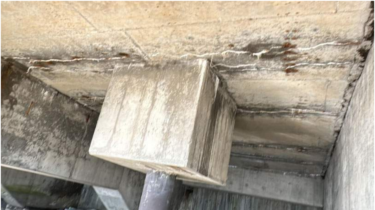
Tags:Pile Caps Date taken:03/11/2025 Media 54: Bent 10, P-10, Underside between Bents 10 and 11.