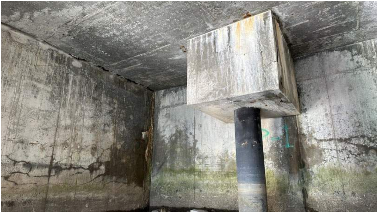
Tags:Pile Caps, Report Date taken:03/11/2025 Media 214: Bent 47, P-46, Underside between Bents 46 and 47.