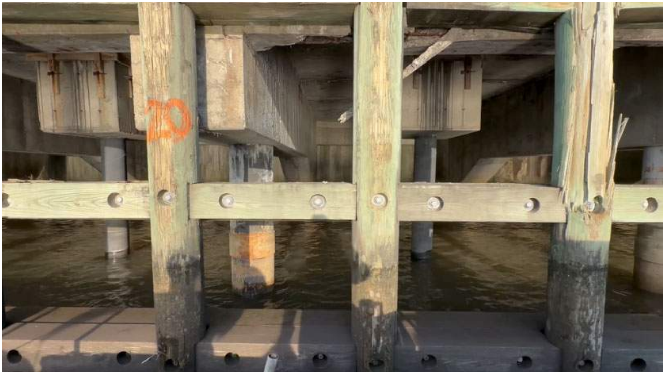
Tags: Pile Caps Date taken: 03/24/2025 Media 100: Bent 20, P-20