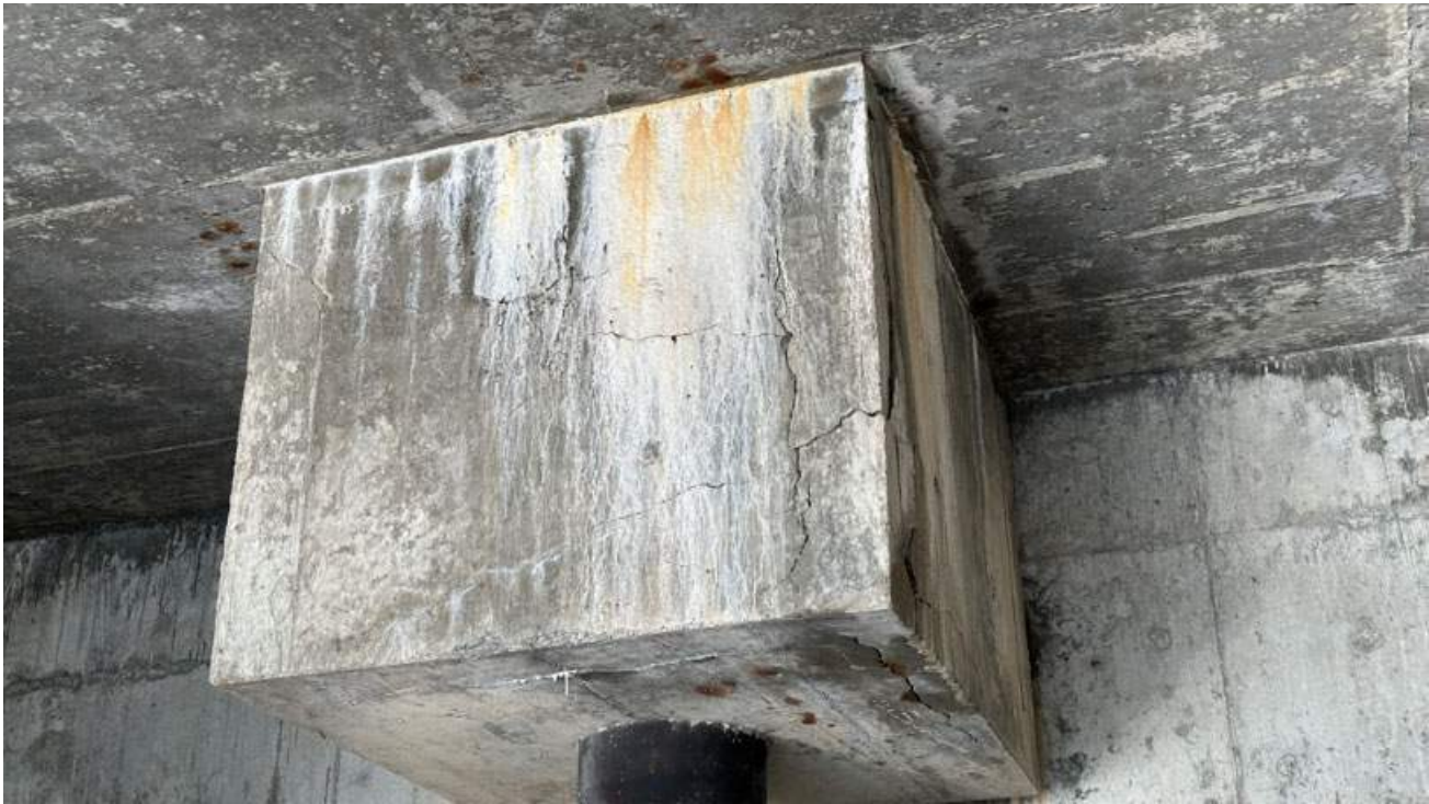
Tags:Pile Caps, Report Photos Taken by:Matthew Seinuk Date taken:03/11/2025 Media 210: Bent 46, P-46, Significant cracking on last rail pile cap.