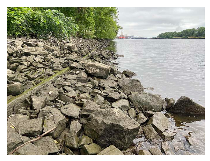
Representative Hudson River shoreline at low tide, Sections 8-9.