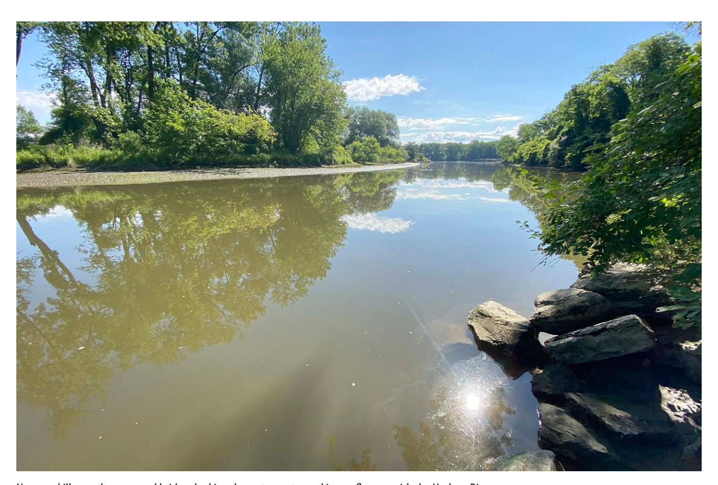
Normanskill near the proposed bridge, looking downstream toward its confluence with the Hudson River.

of 9.5 meters (31 ft) below mean high tide, but all SAV was confined to shallow nearshore subtidal areas. In addition to SCUBA surveys, the entire length of the Hudson River shoreline, and both shorelines of the Normanskill, were surveyed at low tide to check the lower intertidal zone and shallow subtidal zone for SAV. Some of the methods originally proposed for this study were modified due to the absence or paucity of SAV in the survey area (confirmed during the concurrent mussel survey). Biologists recorded locations (upstream and downstream limits) of SAV patches using GPS, and recorded the widths and water depths of each patch. Biologists recorded and photographed SAV species present, approximate and relative density, and substrate.