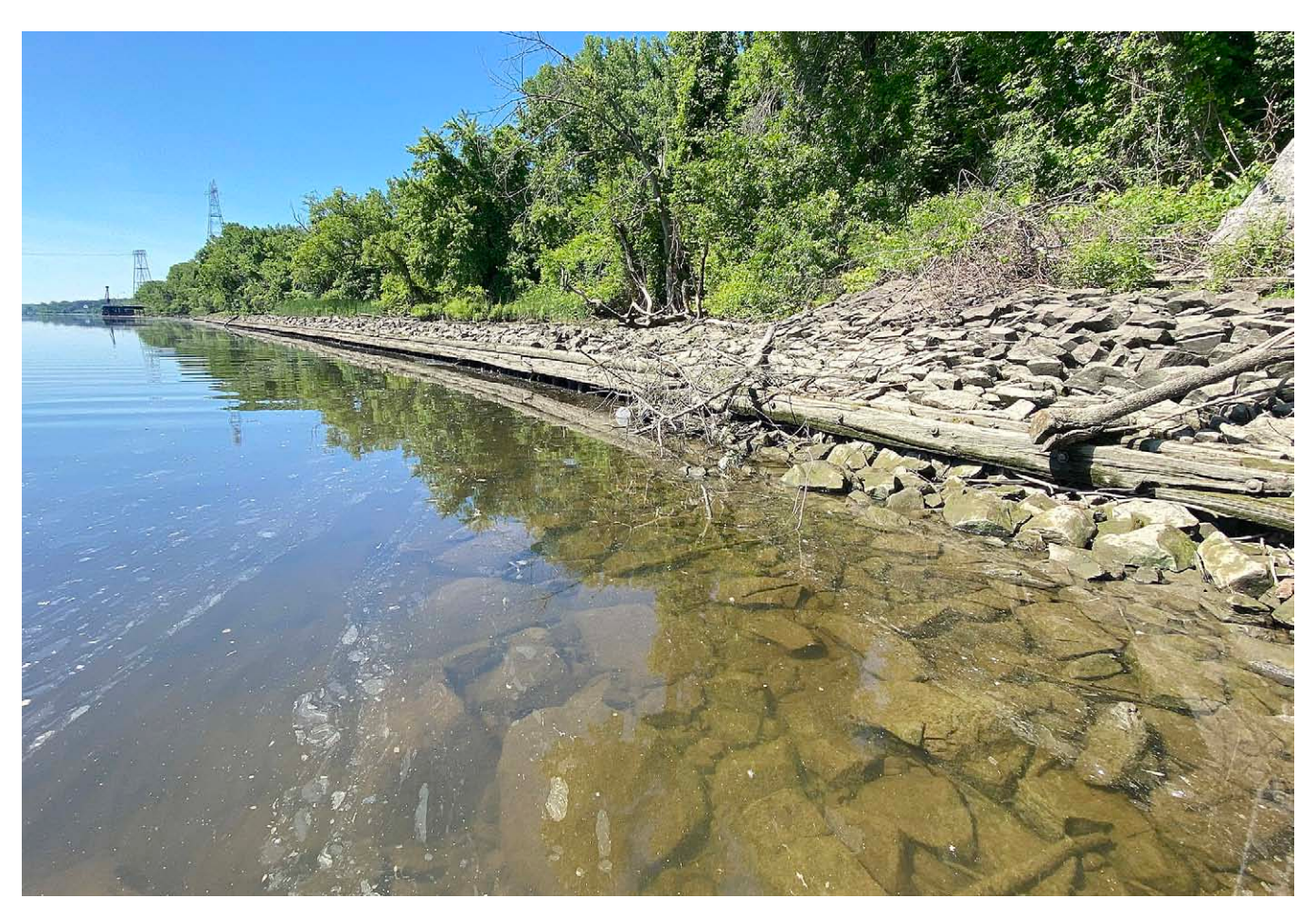
Hudson River shoreline along the proposed Port of Albany development project.