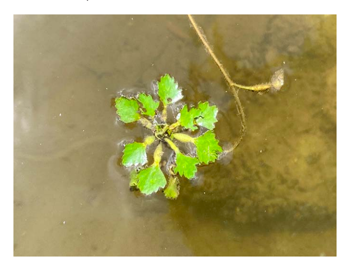
Solitary water chestnut, Trapa natans .

in the Normanskill, and was generally very sparse in the 900-meter reach of the Hudson River, with one notable patch (Patch 2) that contained moderate to high stem densities of V. americana in an area approximately 560 m<sup>2</sup> (75 meters long x 7.5 meters wide). All SAV observed in the Hudson River was concentrated