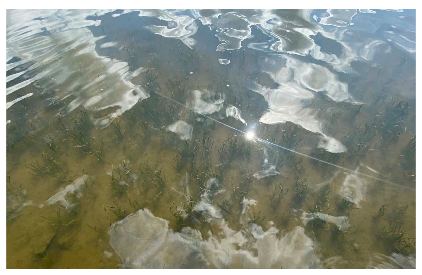
Bed of water celery, Vallisneria americana (Patch 2).