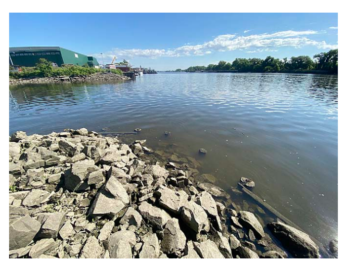
Confluence of the Normanskill and Hudson River, Section 11.