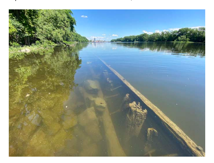
Representative Hudson River shoreline at high tide, near Sections 1-2.