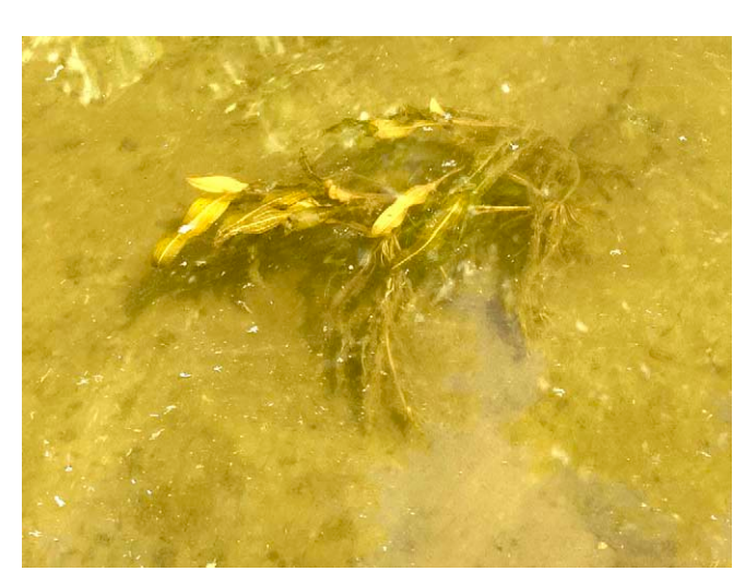
Solitary curly leaved pondweed, Potamogeton crispus.

in the Normanskill, and was generally very sparse in the 900-meter reach of the Hudson River, with one notable patch (Patch 2) that contained moderate to high stem densities of V. americana in an area approximately 560 m<sup>2</sup> (75 meters long x 7.5 meters wide). All SAV observed in the Hudson River was concentrated