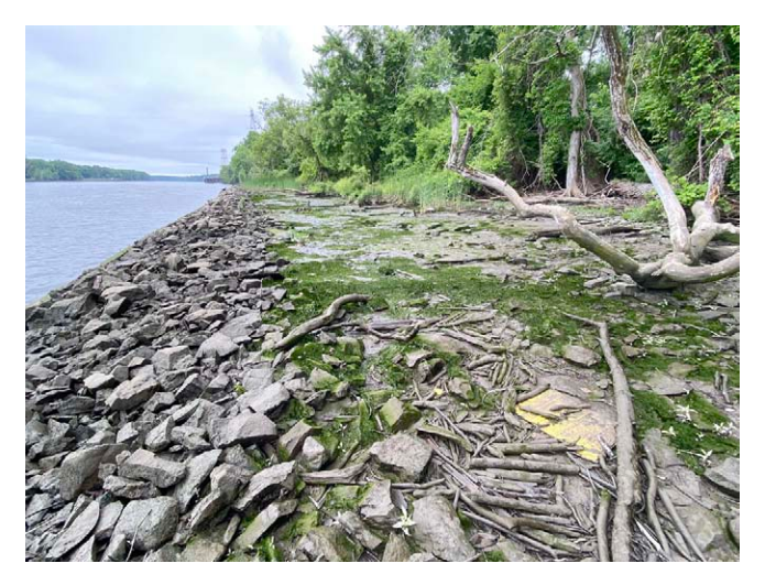
Representative Hudson River shoreline at low tide, Sections 5-6.