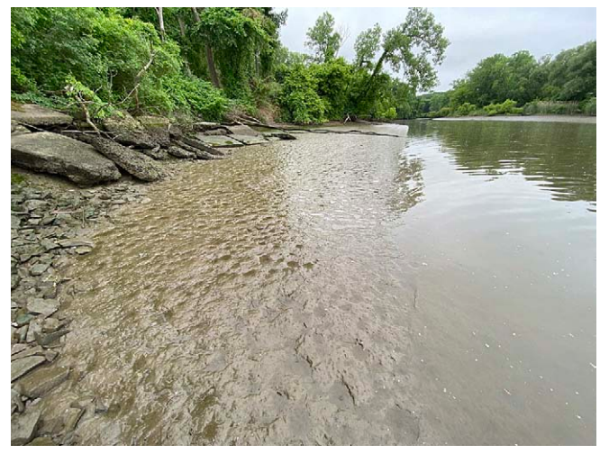
Intertidal mudflat in the Normanskill, river-right.