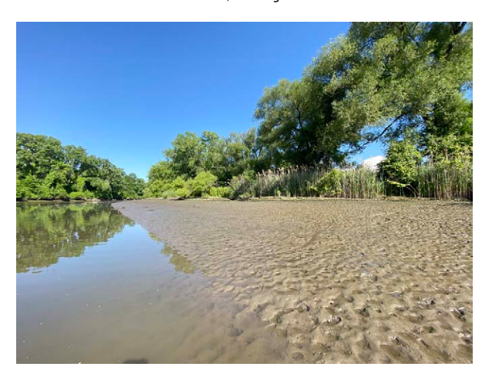
Intertidal mudflat in the Normanskill, river-left.