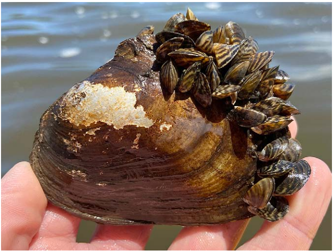
Fragile papershell (Leptodea fragilis) fouled with zebra mussels.