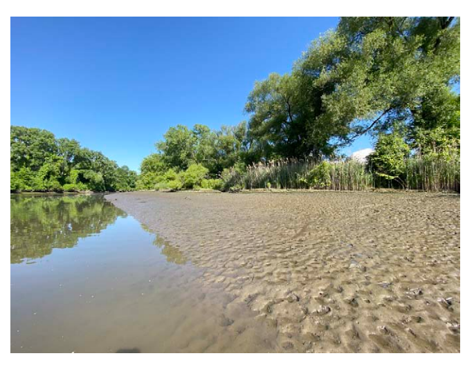
Intertidal mudflat in the Normanskill, river-left.