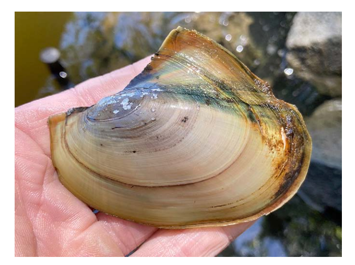
Fragile papershell (Leptodea fragilis) found during the survey.