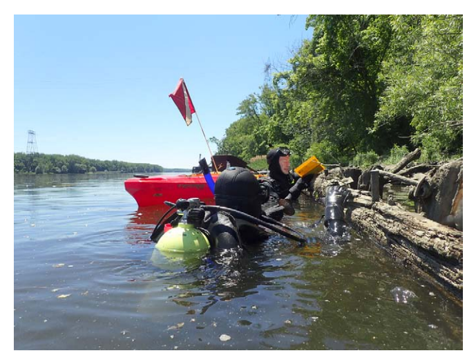
Biologists stopping to record data and photographs.

Due to deep and turbid water, biologists conducted surveys of the subtidal areas of the Hudson River and Normanskill almost entirely by SCUBA diving. Three SCUBA divers worked together to systematically survey each section, and stopped to record data after each section was completed. In addition, the entire length of the Hudson River shoreline,