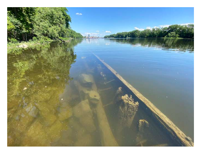
Representative Hudson River shoreline at high tide, near Sections 1-2.