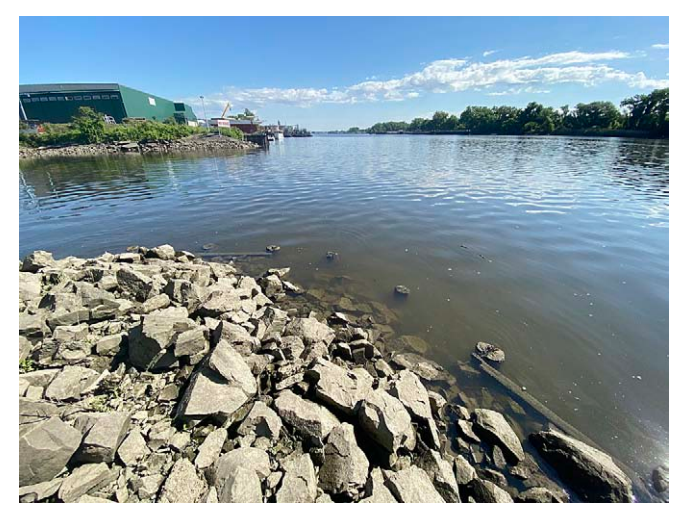
Confluence of the Normanskill and Hudson River, Section 11.