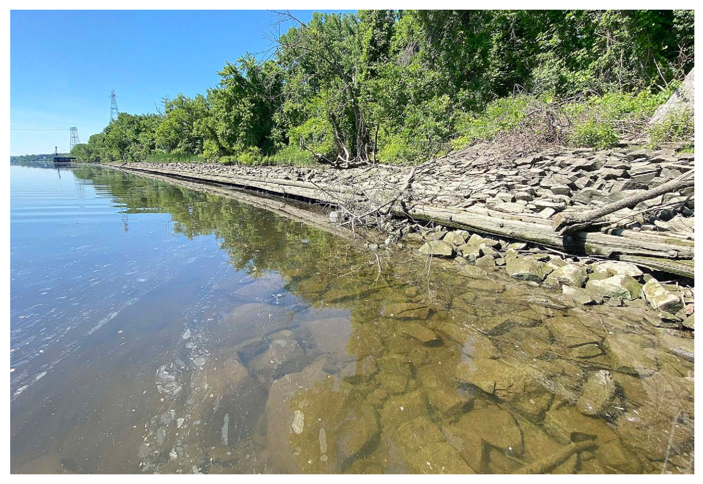
Hudson River shoreline along the proposed Port of Albany development project.