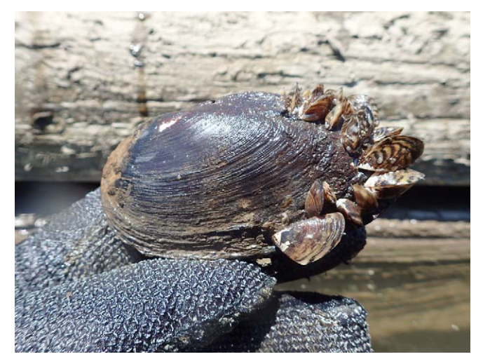
Eastern elliptio (Elliptio complanata) found during the survey.

The primary objective of this mussel survey was to determine the presence, density, distribution, and habitat of any state-listed (Endangered [E] or Threatened [T]) or stateranked (S1, S1/S2, or S2) mussel species in areas of the Hudson River or Normanskill that would be affected by the proposed Port of Albany development project. No E, T, S1, S1/S2, or S2 mussel species were found. Biologists documented a low density of one common native species in the Hudson River ( E. complanata ), and a low density of one species that is native to New York but not native to the Hudson River (L. fragilis), and shells of two other native species (A. implicata and L. radiata ). No live native mussels were found in the Normanskill. It is likely that the combined effects of zebra mussels, historic habitat alteration, and water quality have contributed to the paucity of native mussels in these areas. We do not recommend further freshwater mussel surveys or monitoring for this project.