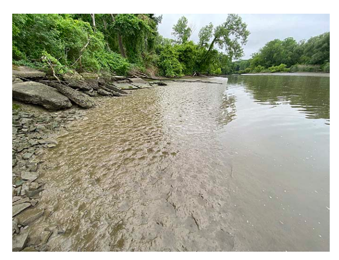
Intertidal mudflat in the Normanskill, river-right.