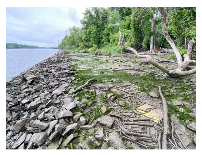
Representative Hudson River shoreline at low tide, Sections 5-6.