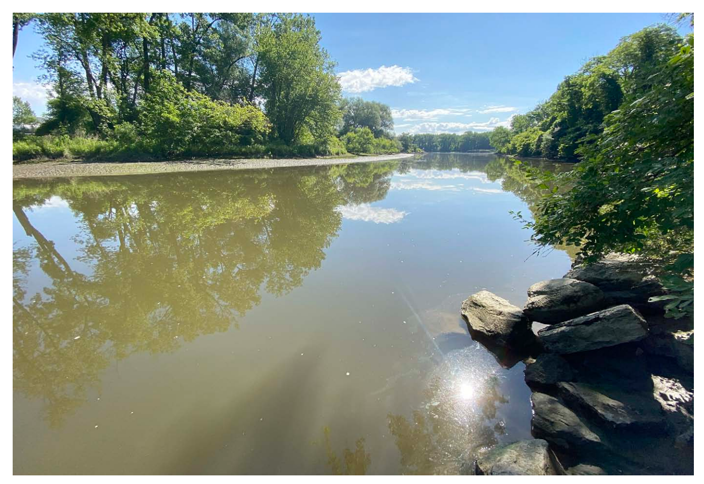
Normanskill near the proposed bridge, looking downstream toward its confluence with the Hudson River.