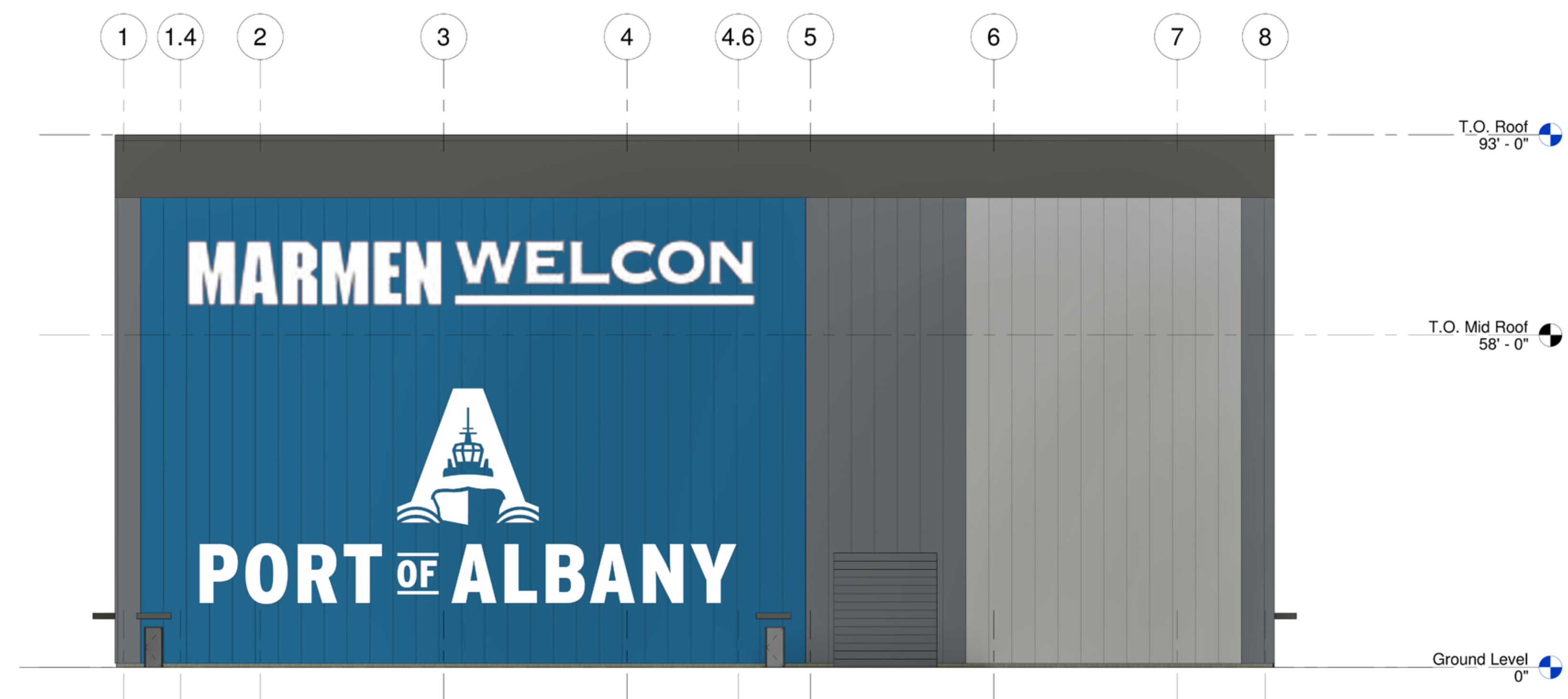
2 East Elevation - Presentation A-000D 1/16" = 1'-0"