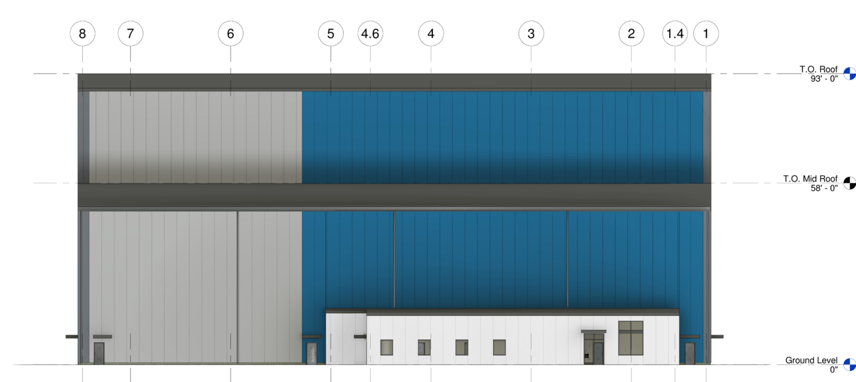
1 West Elevation - Presentation A-000D 1/16" = 1'-0"